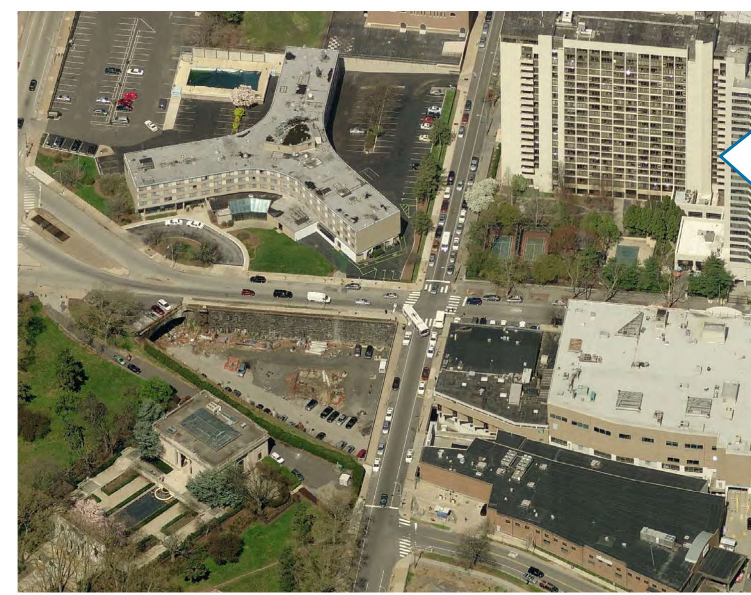
Behind the Rodin, Existing Conditions