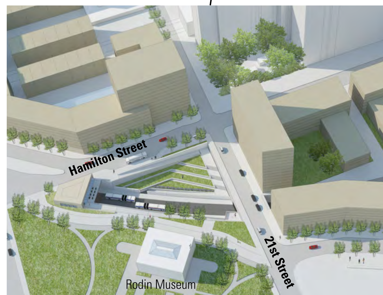
BRT Behind the Rodin